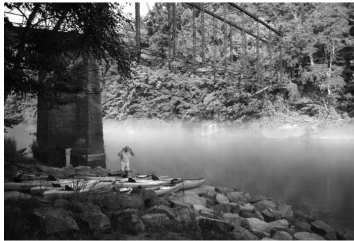
Morning mist at Settles Bridge in Gwinnett County.

Each journey offered different high points, as the paddlers in colorful kayaks and a few canoes experienced the river's diversity, beauty and history. The dense fog