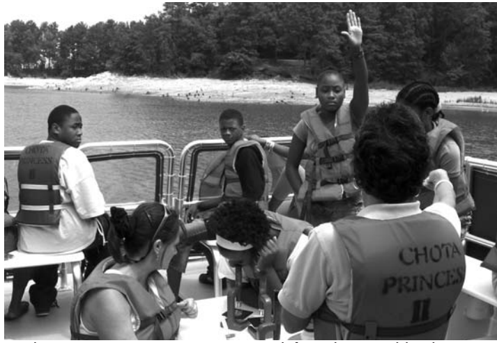
A student uses a microscope to examine a water sample from Lake Lanier, while a classmate waits to be called on by the floating classroom instructor.

UCR's Lake Lanier Aquatic Learning Center, known as our floating classroom, has been teaching metro students about water pollution, lake ecology and conservation since 2000. During this time, we have reached more than 15,000 students, teaching them how to be good water stewards by offering hands-on learning experiences and activities that incorporate science, math and natural history lessons.