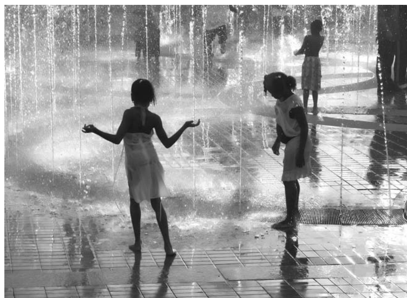
Children playing in Centennial Park's Fountain of Rings.

We do not know if local governments are actively enforcing watershed protection measures. Importantly, the District cannot tell us if we are making tangible progress toward cleaning up the rivers and lakes in metro Atlanta,