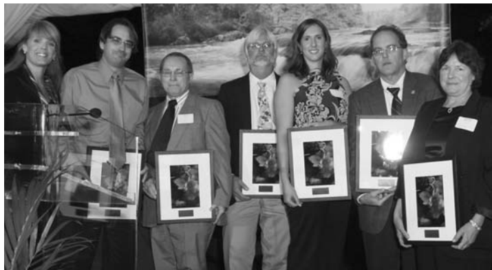
River Heroes: Georgia Riverkeepers

And finally, the River Heroes Award was presented to the six other Georgia Riverkeepers , our partners in watershed protection who tenaciously watch over the Altamaha, Coosa, Flint, Ogeechee-Canoochee, Satilla, and Savannah Rivers. (See below)