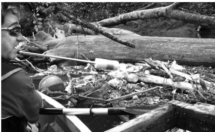
R!OT Atlanta's Jeff Doud surveys floating river trash.

The land-based groups cleaned under and around the I-285 Bridge over the Chattahoochee below Peachtree