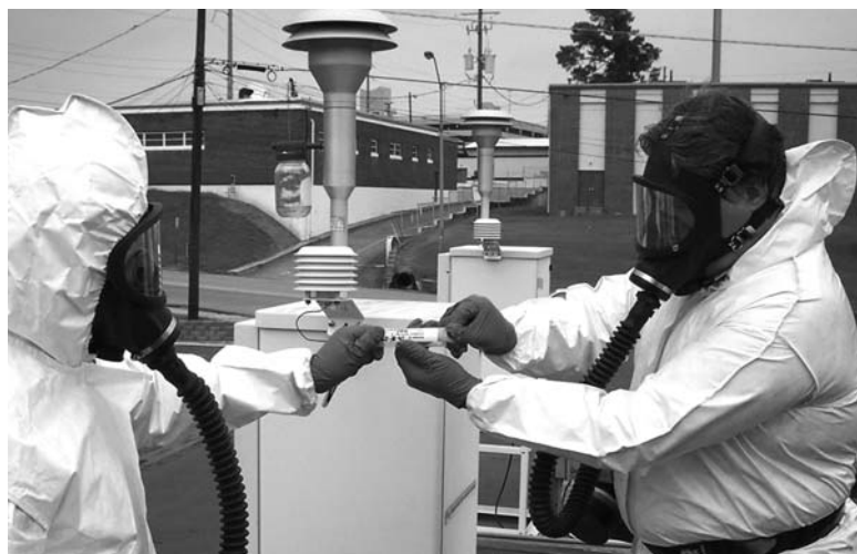
Georgia EPD's Emergency Response Program, shown here in training, could receive major budget cuts.

Existing EPD positions created by the General Assembly in various state budgets have not actually been filled for several years because of administrative decisions. In addition, many positions in the EPD offer salaries that are so low compared to similar jobs in the private sector that few applicants have applied for them.