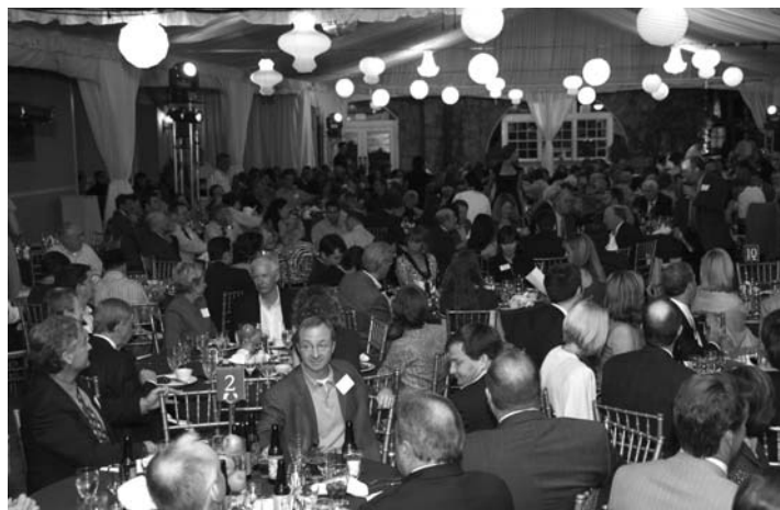
Guests enjoy regionally grown and produced menu at the Patron Dinner.