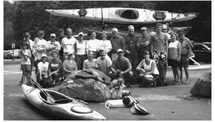
River Discovery Trip Participants

on our first trip, starting at Buford Dam, made navigating the shoals exciting. Our second trip took us past Settles Bridge, the site of a bank robbery escape early in the 20th century. The robbers took part of the bridge with them, so the law could not follow!