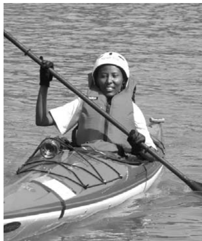
Solo kayaking is one of the most popular categories.

Check-in and late registrations will occur between 6:30AM and 8AM on June 9; the first race event starts at 9AM. All boats should be in the water by 10AM and across the finish line at Riverside Park by Noon in time for lunch and the environmental festival which ends at 2PM. The festival will offer lunch, bluegrass music, dozens of exhibits, a scavenger hunt and a demonstration K-1 Sprint Race.