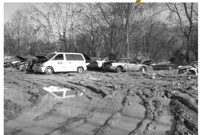
Dozens of junk cars line the top of the riverbank in Cobb County.

At M and R Used Auto Parts , operator Mr. Zee Taher is in the process of removing about 50 cars from the riverbank, however, we have had to visit this property repeatedly to make sure that progress is continuing to remove the junk cars and implement a stormwater control plan. Cobb County has agreed to help Mr. Taher clean up the large mound of old tires, concrete and trash also collected at this site.