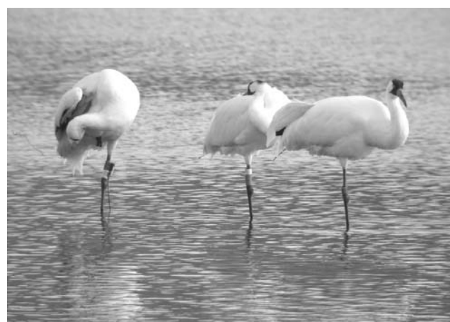
During migration, endangered whooping cranes visited Bull Sluice Lake in 2006.

Hydropower licenses are regulated by the Federal Energy Regulatory Commission (FERC) through a process that generally takes three to seven years. In 2002, FERC developed a new Integrated Licensing Process (ILP) and Georgia Power decided to use it at Morgan Falls Dam.