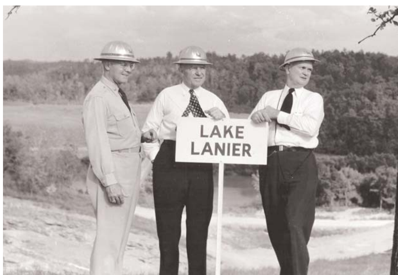
General Holle's Inspection Party at Buford Dam in September 1953.

To commemorate the 50 years that have passed since the