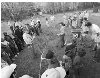
Boy Scouts learn how to identify alien plant species.

On Saturday March 24, hundreds of Boy Scouts, their adult leaders, and National Park Service staff assembled at the Powers Island Unit of the Chattahoochee River National Recreational Area to eradicate alien plant species from along the river's edge. Chinese Privet, Bamboo, Elaeagnus and English Ivy were the main targets.