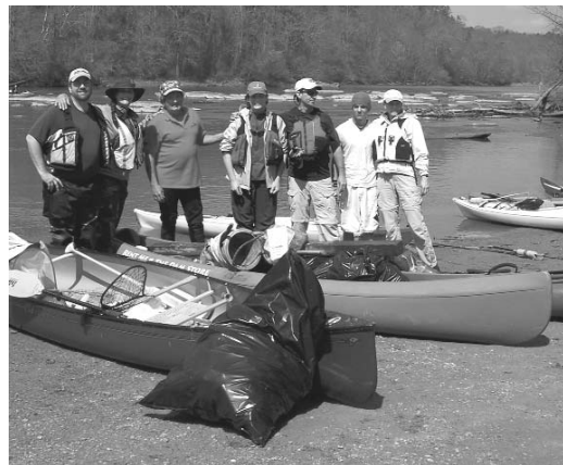
Some of the cleanup crew used kayaks to tackle trash in the river.

While some volunteers helped the state DNR stock trout in the river, others created a new foot path along the river and built several suspension bridges across tributaries to connect sections of the path. Still others