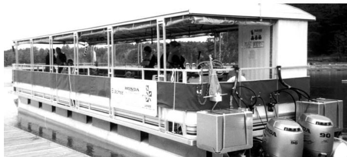
The Chota Princess!

Fuel capacity is 54 gallons total and both engines, batter-