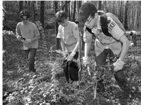
This is how to eradicate privet!

deciduous and remains green during winter, which gives these invasive plants an earlier growing start in the spring. As a result, they squeeze neighboring native plants out of sunlight. Birds