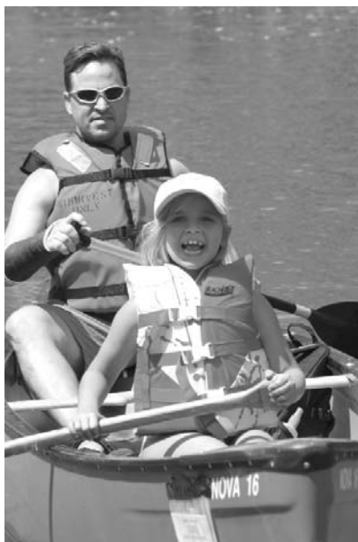
Father and daughter team finish with a big smile.

It's time for paddlers of all ages and skills to sign up for the 5th Annual Back to the Chattahoochee Race and Festival! As in previous years, the event will be held on the river near Roswell with the 8-mile race course running from Garrard Landing Park to Riverside Park for recreational boaters. Your hosts—city of Roswell, National Park Service, Upper Chattahoochee Riverkeeper , and Fulton County —are planning for the biggest and best race and festival to date.