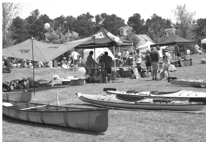
Festival attendees enjoy environmental exhibits, music and good food.