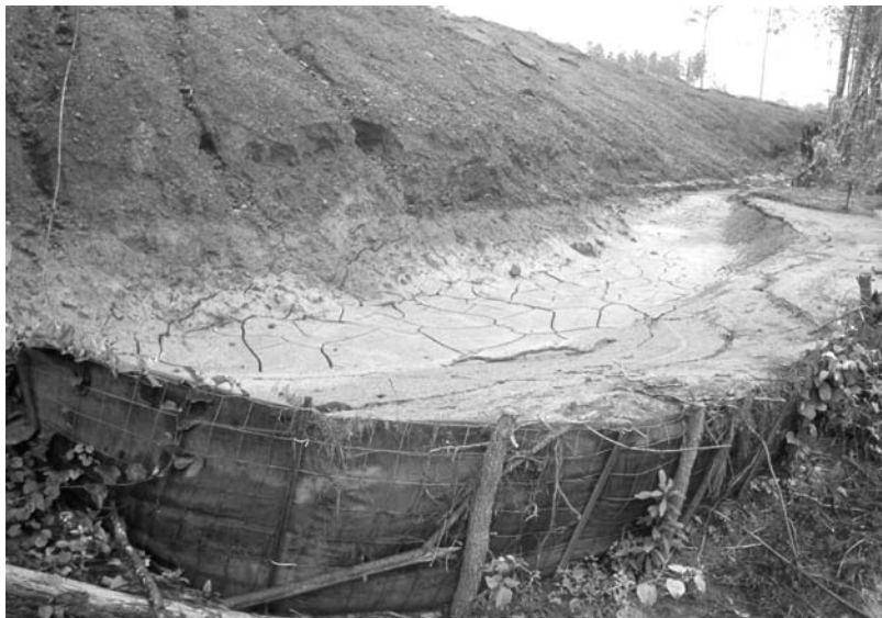
Silt fence full of mud at a subdivision site constitutes an erosion violation.